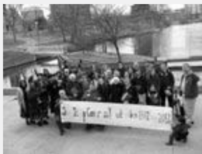
'Step It up' campaign

People came back inspired, hopeful, charged up and re-energized to continue the work of building a stronger and more effective movement for social and economic justice in W. Mass. and beyond.